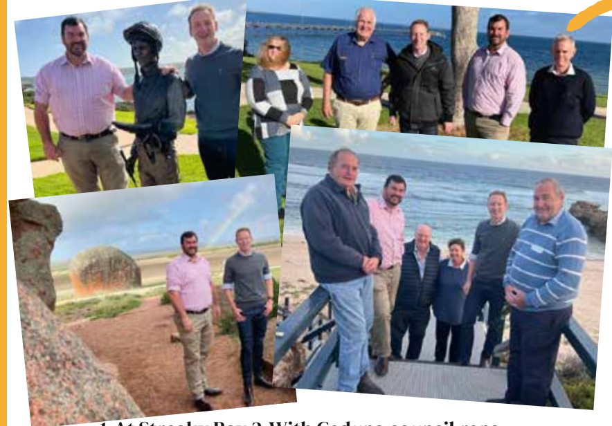
1-At Streaky Bay 2-With Ceduna council reps 3-At Murphy's Haystacks 4-With Elliston council reps